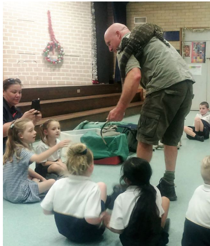
Wildlife Aid Upper Hunter Valley bringing Australian Wildlife Displays to kindergarten pupils.