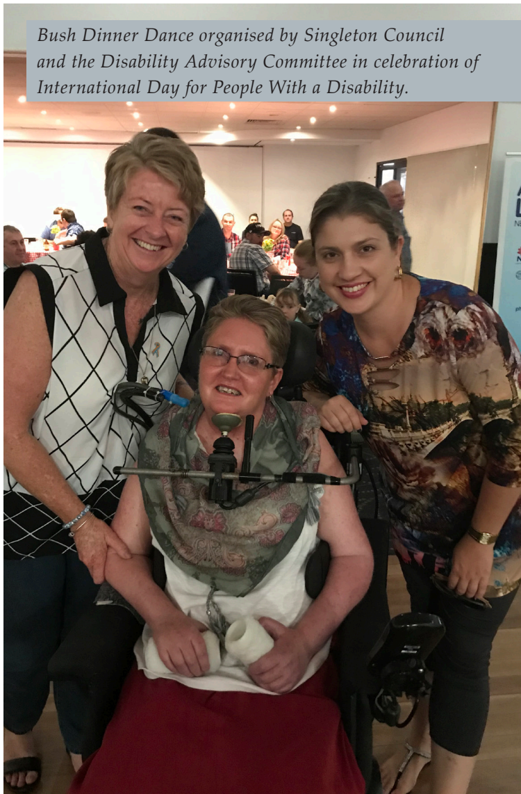
Bush Dinner Dance organised by Singleton Council and the Disability Advisory Committee in celebration of International Day for People With a Disability.