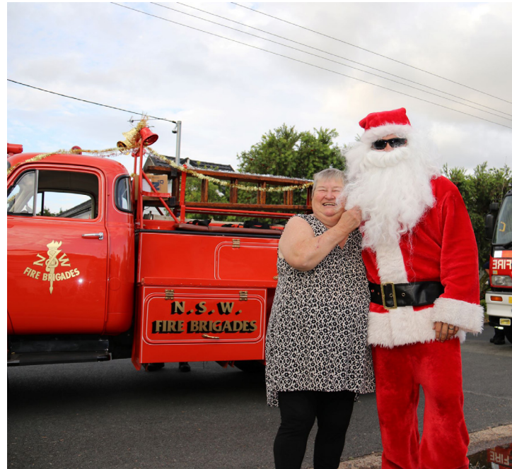
A donation was given to the Singleton Fire Brigade Social Club for the Singleton Christmas lolly run.

Round 1 of the 2019 Community Grants program opens on 8 April 2019 and closes on 6 May 2019. If you or a community group are interested in applying for funding, please go to https://hvo.smartygrants.com.au/HVO2019RoundOne or contact Merri Bartlett on 0455 782 292 for further information.